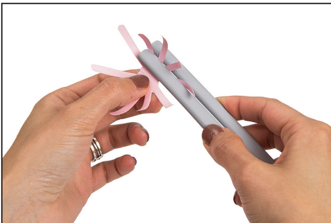
5. Shape the stamen with the Crease & Curl Tool.