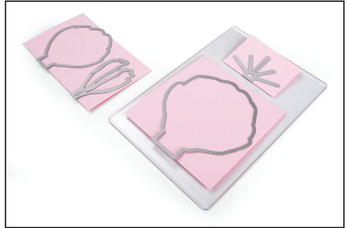
2. Die-cut with the edge of the die slightly overhanging the fold.