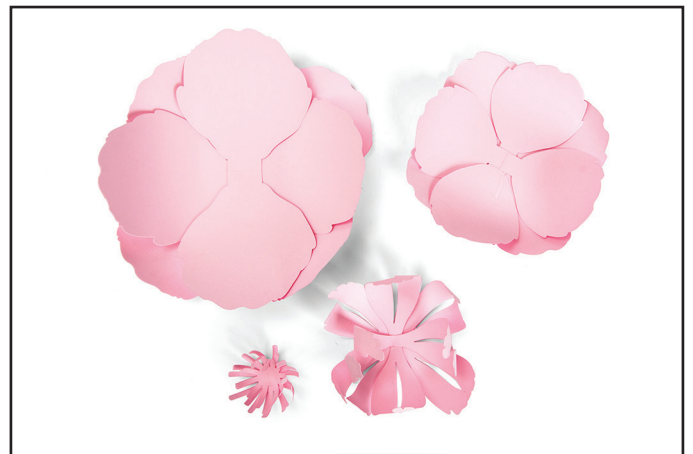
6. Adhere the flower layers together from the bottom up, alternating the petals.