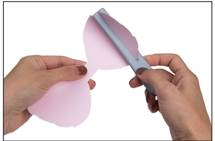
4. Shape the petals with the Crease & Curl™ Tool.