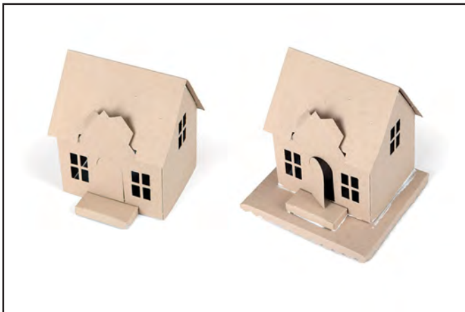
5. Adhere the porch step to the front of the house below the door. Adhere the Dwelling and porch step to the base.