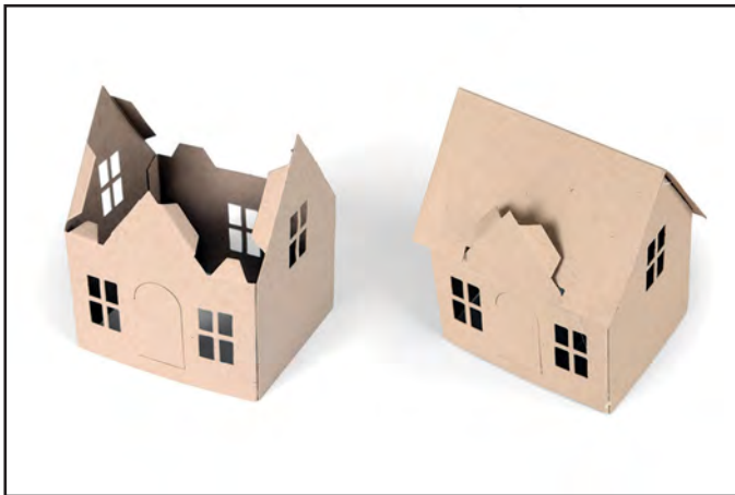
3. Adhere remaining wall tab to corresponding wall to create the body of the Dwelling. Fold the roof tabs inward and adhere the roof piece as shown.