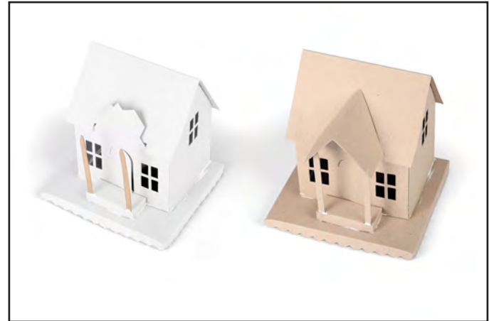
6. Insert the columns into the slits at the front of the porch step. Fold the tips of the columns over to fit the roof of the portico. Adhere the roof to the tabs of the house and the tips of the columns.