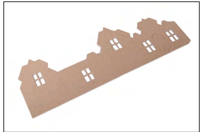
2. Adhere the two wall pieces together.