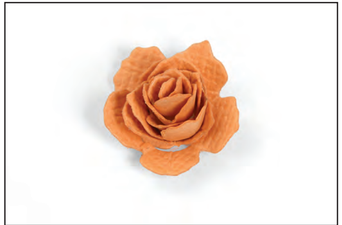
4. Adhere to project.