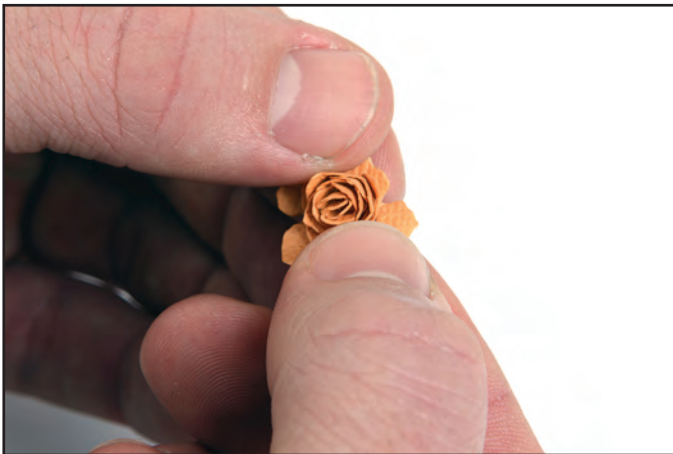
3. Remove from quilling tool and arrange petals.