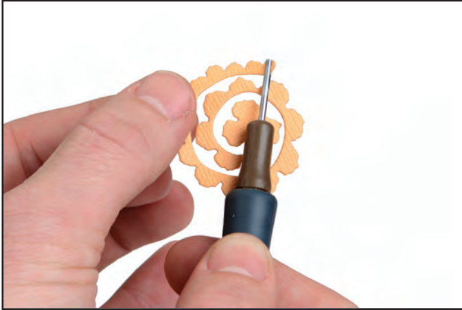
1. Die-cut from cardstock. Insert outside end of Tattered Floral into the tip of the quilling tool and roll towards center.